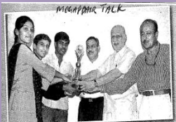
Dr Cherian Award goes to student