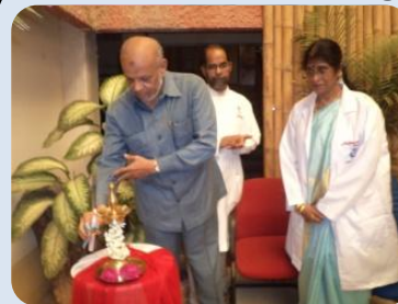
Youth Red Cross Inauguration