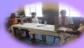
TANKER SCREENING CAMP – BLOOD DONATION CAMP- VOLUNTEERISM