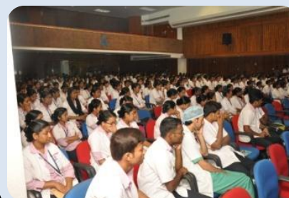
Monthly College Assembly